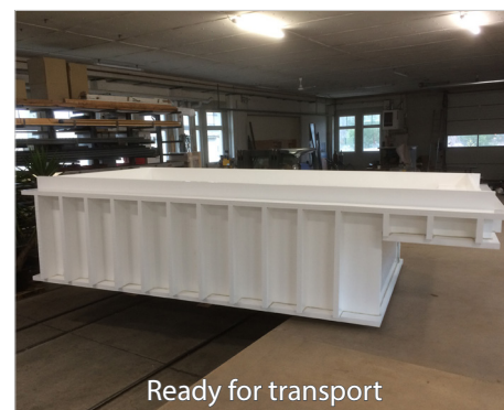
Ready for transport